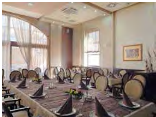
The hotel is located in the city center, on the city promenade.

1/2 room with breakfast 70 eur per room/night