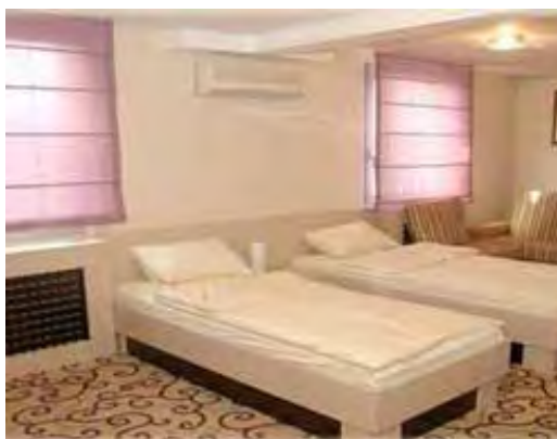
Hotel se nalazi u strogom centru grada, na gradskom šetalištu.